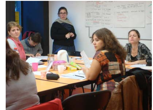
Kick-off Meeting in Paris, October 2013

They will be supported by web and face-to-face tools (blog, drama, visits) implemented with the help of the learners.