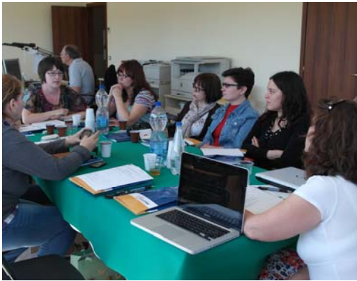
Work Meeting in Rome, May 2014